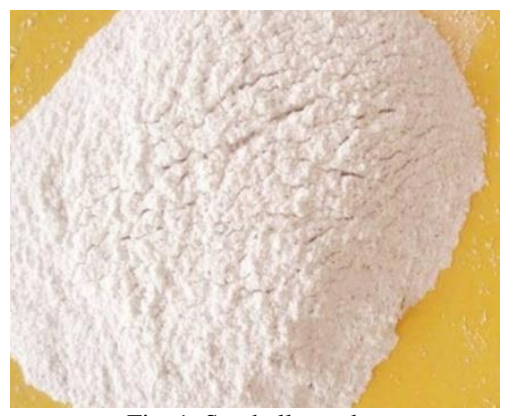
Fig. 1: Seashell powder