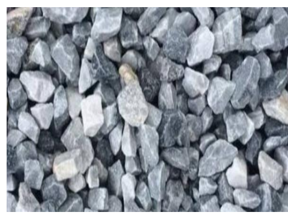
Fig. 5: Course aggregate