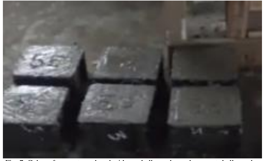
Fig. 7: Cubes of concrete replaced with seashell powder and coconut shell powder