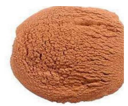
Fig. 2: Cocount shell powder