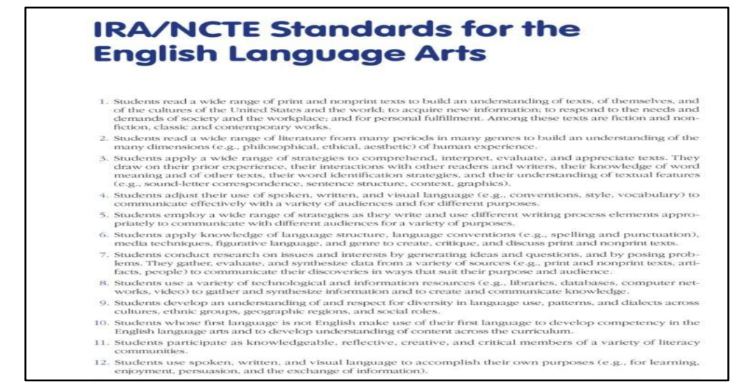
Fig. 2: IRA/NCTE Standards for the English Language Arts

Furthermore, language arts lessons consist of the teaching and learning of four skills. They are oral (listening and speaking), reading, and writing. For the reading as language arts, learners are to read the materials from the children's literature. As for the writing, the focus is on the writing for creativity and motivational strategies rather than the grammatical. While for oral skills, it is to create a platform for creative performance such as doing creative drama or to sing songs for enjoyment (Donoghue, 2009). Teachers need to note that there is a standard that they need to follow when carrying out the language arts curriculum.