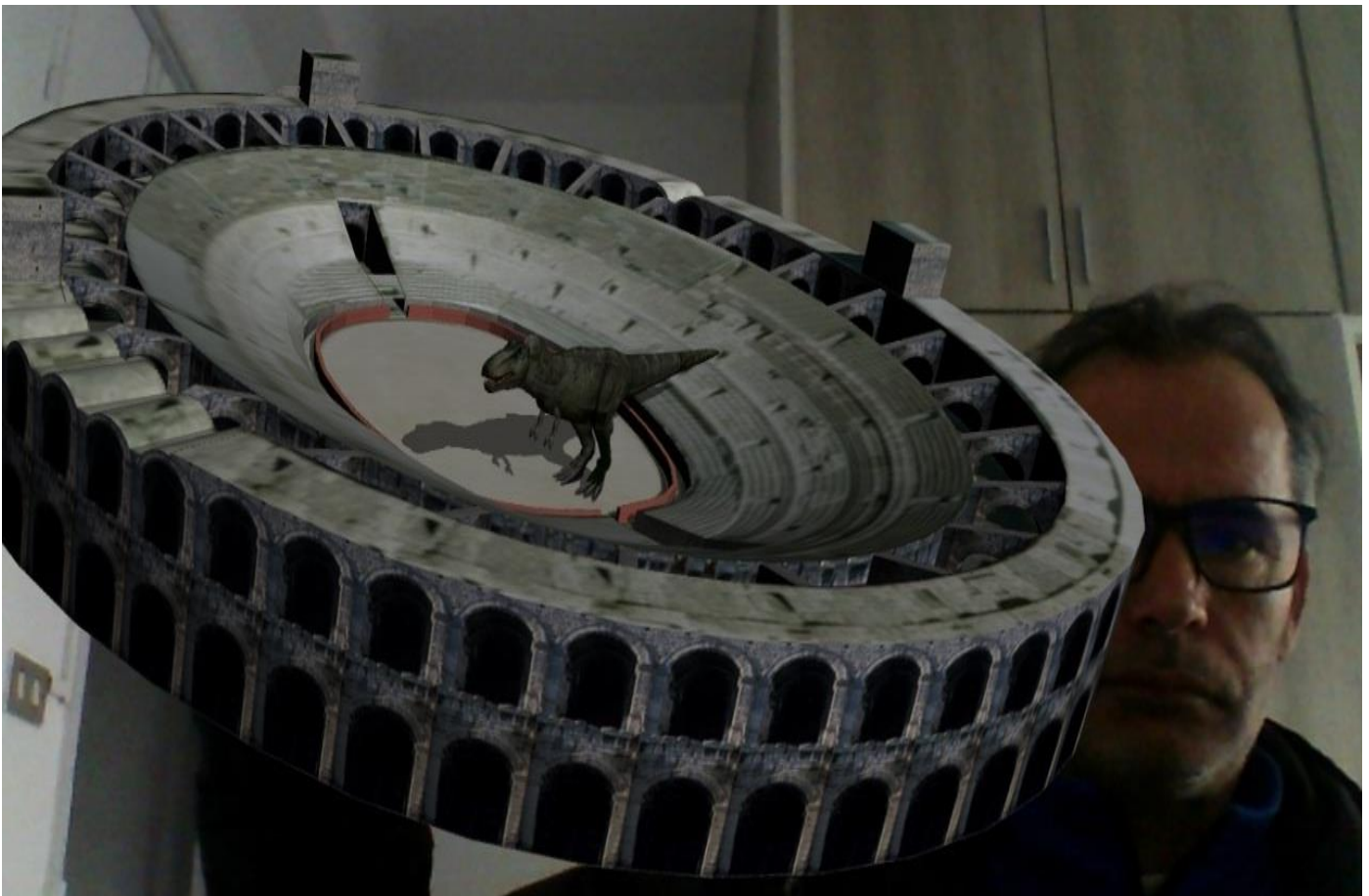
Fig 2 The Advantage is that Augmented Reality is already Accessible to Visitors via Mobile Devices