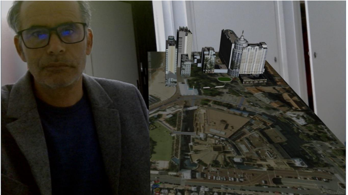
Fig 1 Modeling and Application of AR

environments, adding authentic context conducive to knowledge transfer and skill development.