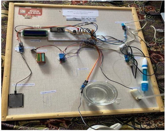
Fig 2 Complete Hardware Diagram

These components work together to collect environmental data and transmit it to the Adafruit.io cloud, where users can access and interpret the data. The green LED indicates system operation, while the LCD screen displays information, such as temperature readings, eliminating the need for additional devices. To facilitate data display on a laptop, the Adafruit library will be used.