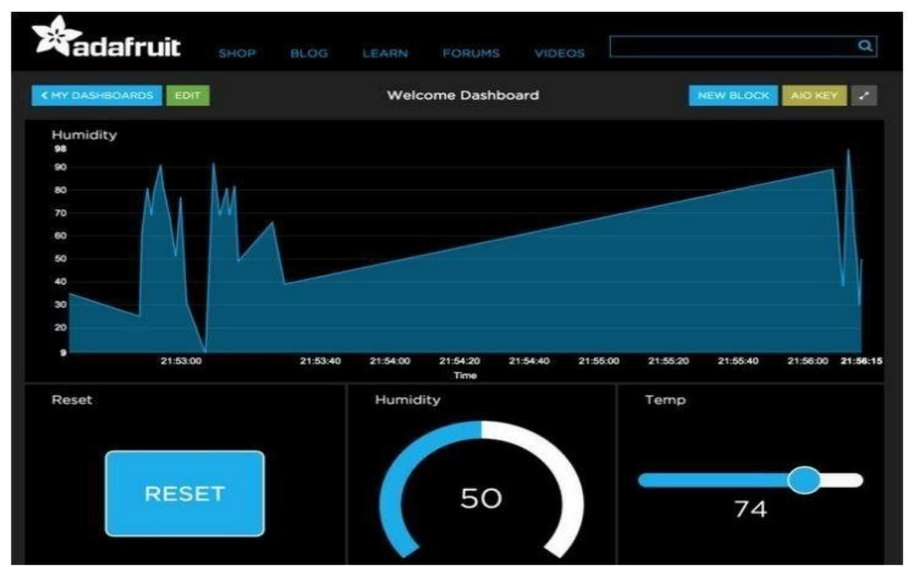
Fig 1 Post Data on Adafrui Api

Figure 1 Shows Adafruit io project Dashboard showing humidity, temperature with rest and many other features to postdata on adafrui Api.