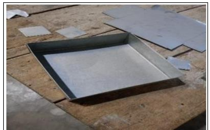
Fig 1: Mould

➤ After Completion of Proper Mixing We Place Mix.