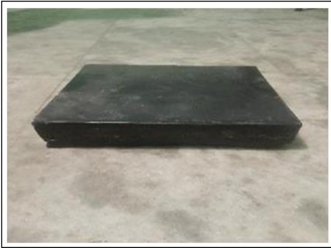
Fig 2: Plastic Paver Block