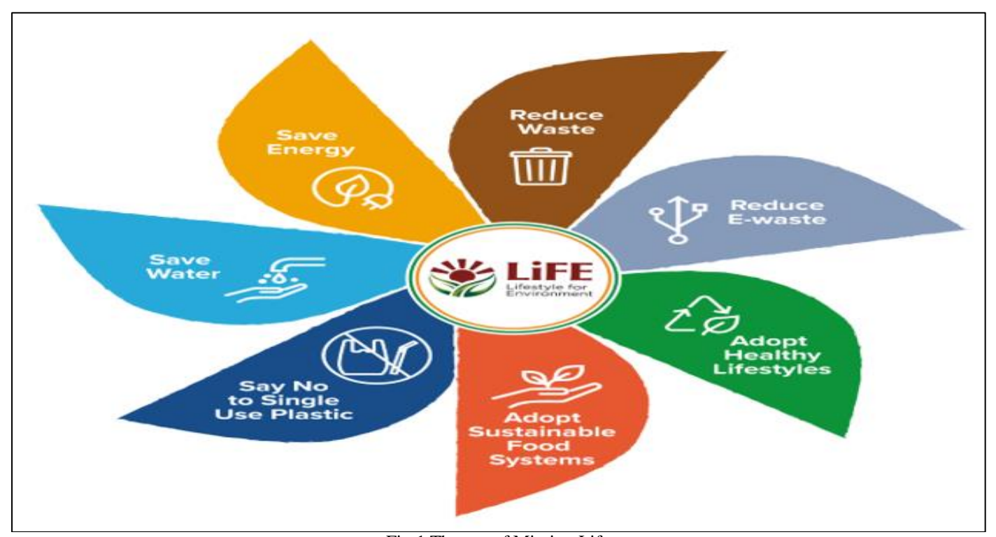
Fig 1 Themes of Mission Life

activities enumerated for environment conscious conservation mechanism with the proper coordination of human and civil society as shown in table