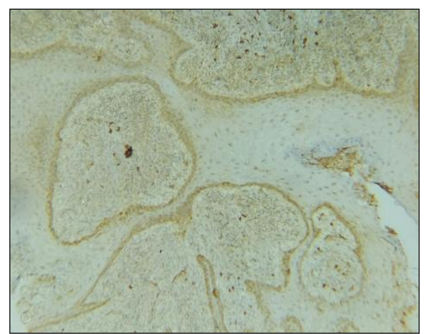
Fig 1: Negative Intracytoplasmic and Positive Basement Membrane Staining for Laminin in WDSCC (IHC, 10x)

* Fisher's exact test p value <0.05 indicates statistically significant