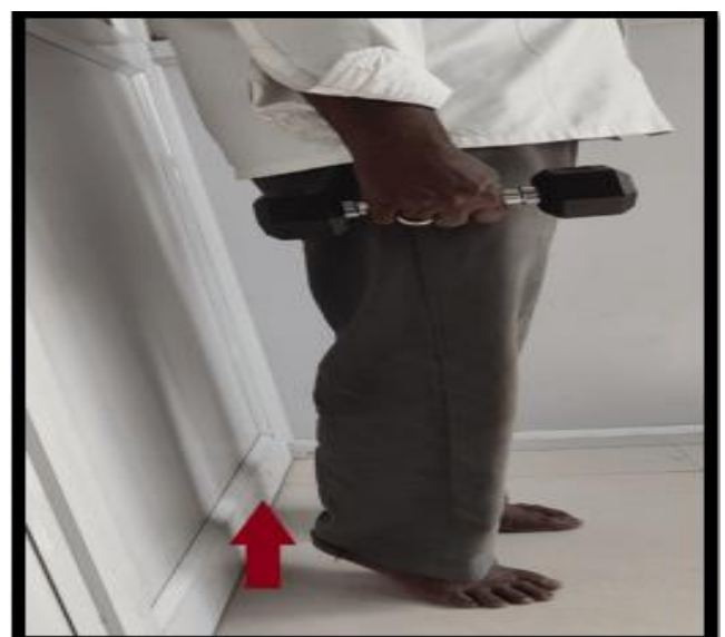
Fig 6: Heel Raises with Weights