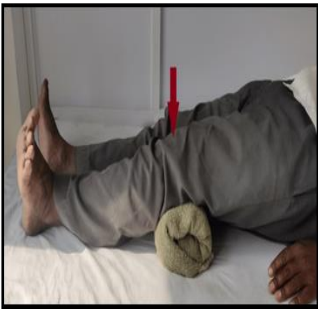
Fig 2: Static Quadriceps

Protocol is a total of 4 weeks, 3 sessions per week. All exercises were performed within pain-free range, without use of trick or forced movements. According to the protocol some of the exercises like Static Quadriceps (Fig.2), Static Hamstring (Fig.3), Dynamic Quadriceps with weight-cuff (Fig.4), Pelvic Bridging with dumbbell (Fig.5), Heel raises with dumbbell (Fig.6) are shown in the images which were performed by the patient.