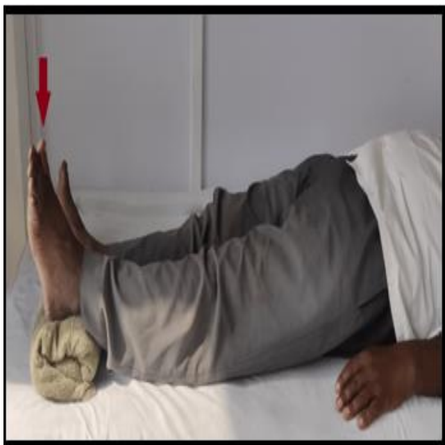
Fig 3: Static Hamstrings