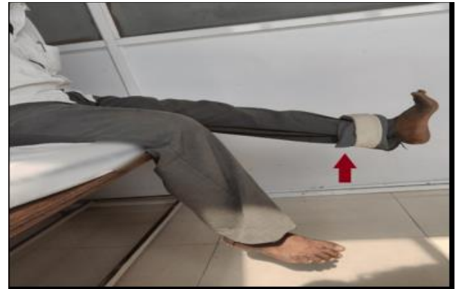
Fig 4: Dynamic Quadriceps with Weight Cuff