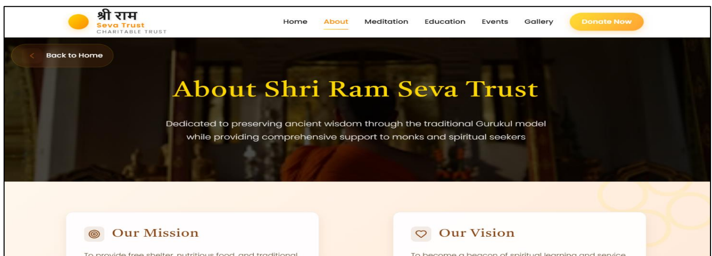
Fig 2 About Shri Ram Seva Trust