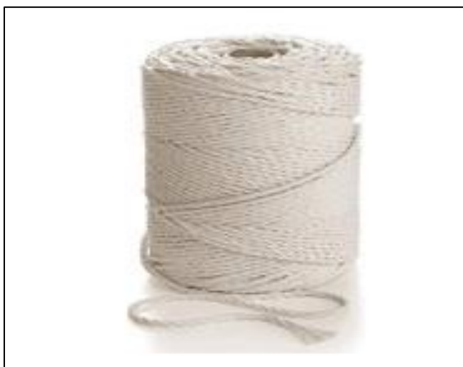
Fig 1 Cotton Macrame Yarn

Cotton macramé yarn was selected as the base material for this study due to its high absorbency and suitability for knot-based textile construction. Natural dyes were obtained from Rubia tinctorum (madder root) and Indigofera tinctoria (indigo leaves), which are widely known for producing red and blue shades, respectively. Alum was used as a mordanting agent at an appropriate concentration to enhance dye fixation and improve colour fastness properties. For functional finishing, Michelia champaca flowers were utilized to impart a natural fragrance to the dyed yarns.