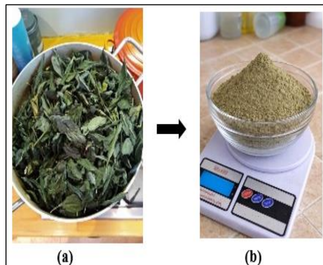
Fig 3 Indigofera tinctoria (a) Dried Leaves and (b) Powder