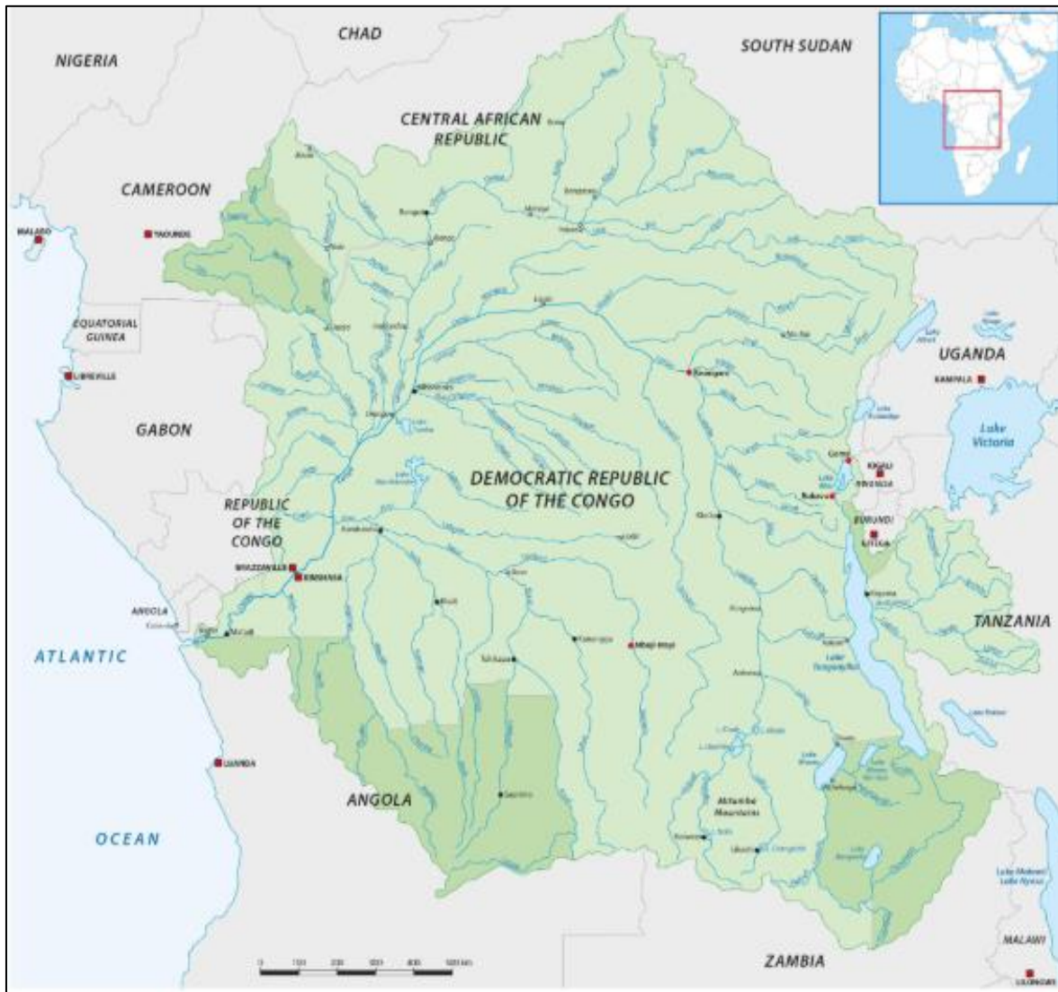
Fig 1 Location of the Study Area.

This area encompasses not only the city of Kinshasa but also the surrounding geological formations which can influence the spatial distribution of geomagnetic anomalies. Our study area is shown in Figure 1.