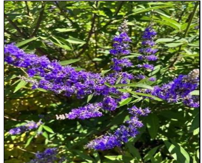
Fig 4 Vitex agnus-castus