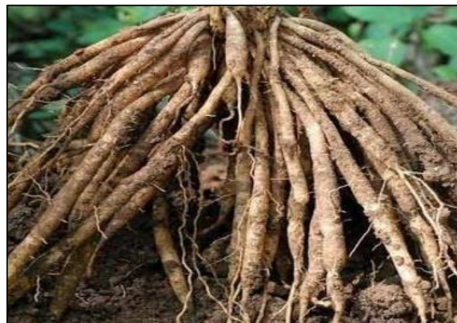
Fig 3 Asparagus Racemosus (Shatavari)