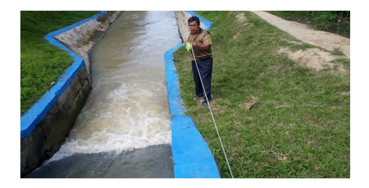
Fig. 3 Riset Field

From the results of field research in district irrigation seirampahserdangbedagai district in the can: (9)