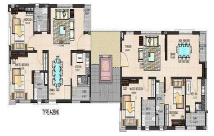
Fig 2:- Plan of the building