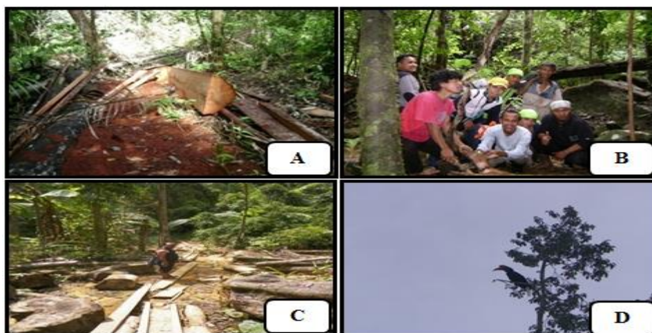
Fig 1:- Various Community Destructive Activities A. illegal logging, B. Anoa being captured by the community, C. destructive activities for mining purposes, D. Protected endangered bird

of individuals, increase or decrease of the birth rate, increase or decrease of the mortality rate, or to regulate its habitat to change the population density and species spread. The fauna in this forest is often captured to be sold or slaughtered by the community such as Anoa (an endemic animal that looks like a mix of wild boar and deer). Various destructive community activities spotted within the forest area are presented in Figure 1 below.