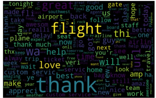
Fig 2:- Positive and Null Wordcloud