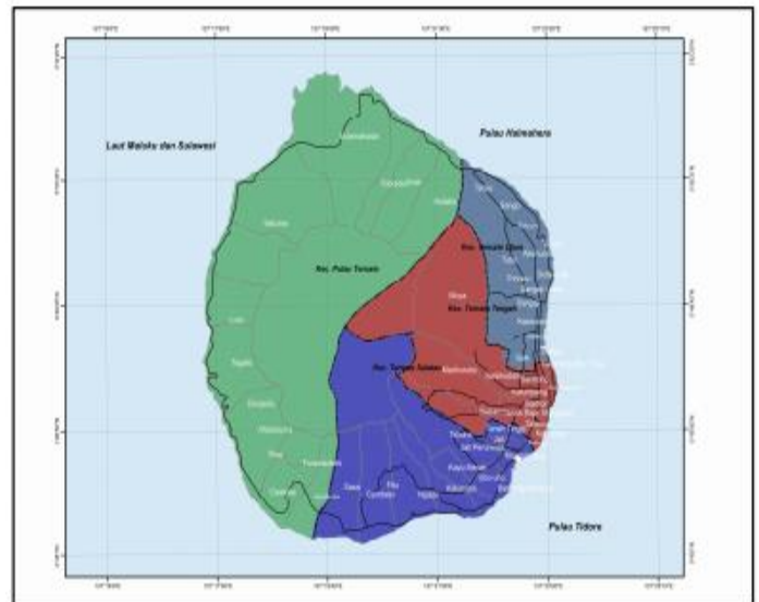
Fig 2:- The Map of Ternate Island

In general, Barifola is almost the same as other house makeover programs that are broadcasted in one of the television stations in Indonesia. But, the thing that makes Barifola different from those TV programs is the foundation to do this. It is based on family fundamental, kinship feeling, and the same origin that move the people there to help each other [6]. The interesting part is that Barifola also has attention in the effort of pushing the society to work together. The local women’s community also provides food for the workers.