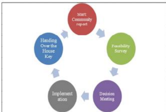
Fig 1:- Barifola Scheme

The source of the funding of the program is from donors and also people from Tidore ethnic that is under one movement called Calamoi (One Thousand Rupiah Movement). In constructional, the house that is going to be built is semipermanent houses with the area of 7x6 meters with 2 bedrooms, a living room, a dining room, doors, panel window with ceiling, electricity installation, and drinking water. But, in the implementation of the house’s sizes can change depends on the existing data source. In some houses that are already built, a few teams from the Community Organization of Tidore Family donated tiles and furniture. The social capital owns either individual or group really influences society’s participation [7]. Social capital formed from the social bond, that results in positive society collective acts. That social bond formed from the social network that makes coordination and communication happen, as well as the belief that implies to trust each other, and norms within groups. That’s why solidarity is formed and creates regulations and penalty [8].